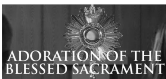
ADORATION OF THE BLESSED SACRAMENT

***El Viernes, 7 de Mayo a las 10:30am-11:30am-Hora Santa y Adoración del Santísimo. Vengan a compartir unos momentos en la presencia de Jesús Sacramentado.